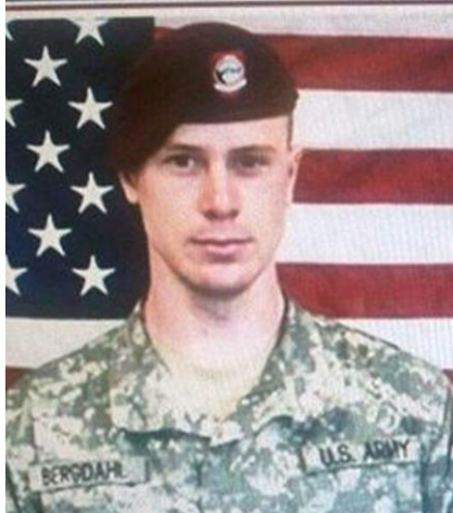
SGT Bowe Bergdahl