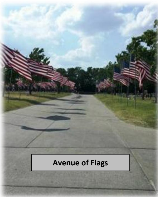
Avenue of Flags

On Monday, May 28 th , we assisted the Boy Scouts from Indian Nations Council in helping to lower and fold 3053 flags at Floral Haven Cemetery; This was the 40 th Anniversary of the Avenue of Flags. It was a beautiful weekend.