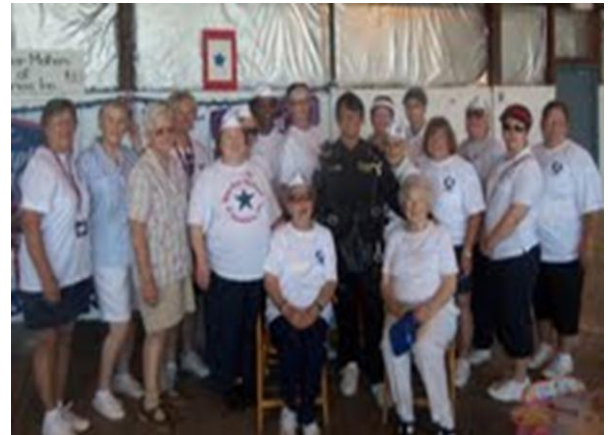
Ohio Blue Star Mothers Strong